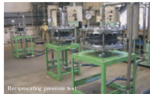
Reciprocating pressure test