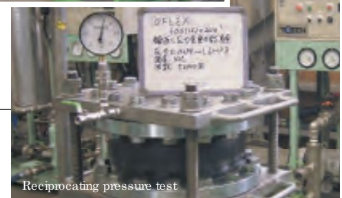
Reciprocating pressure test

Note: The content of this catalog is subject to change without prior notice.